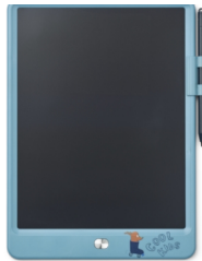
Color code: 2642 Color name: Tiger / Beach blue