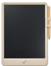
Color code: 1911 Color name: Dog / Sandy

This declaration of conformity is issued under the sole responsibility of the manufacturer. The object of the declaration described above is in conformity with Directive 2009/48/EU on the safety of toys.