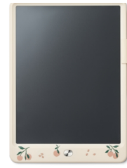
Color code: 1232 Color name: Peach / Sea shell