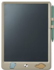
Color code: 2168 Color name: Dinosaurs / Mist