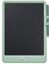
Color code: 7366 Color name: Peppermint