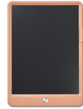
Color code: 2074 Color name: Tuscany rose